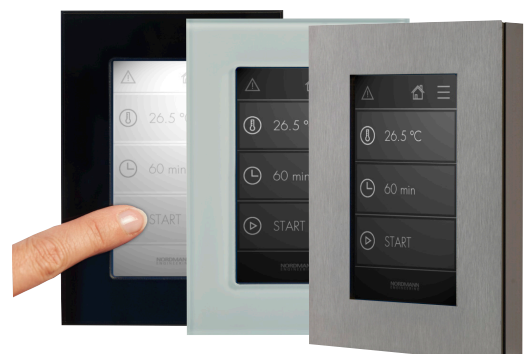
The external display in three versions

The cleverly designed magnetic frame construction, however, also allows steam bath builders to individualize the fitting with a material of the customer's liking.